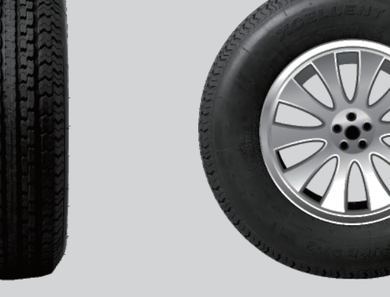
made in Thailand